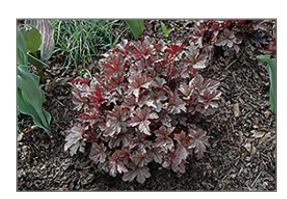
Gunsmoke Foamy Bells