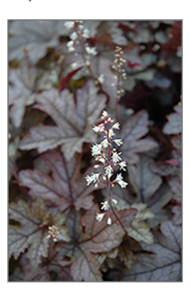
Gunsmoke Foamy Bells flowers

This is a relatively low maintenance plant, and should be cut back in late fall in preparation for winter. It is a good choice for attracting hummingbirds to your yard. It has no significant negative characteristics.