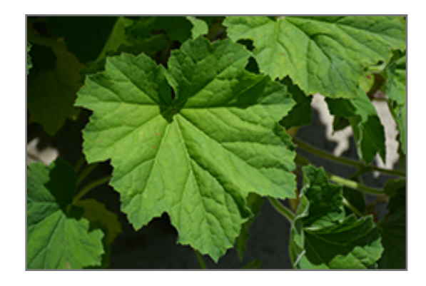
Autumn Bride Hairy Alumroot foliage

Autumn Bride Hairy Alumroot will grow to be about 24 inches tall at maturity extending to 3 feet tall with the flowers, with a spread of 24 inches. When grown in masses or used as a bedding plant, individual plants should be spaced approximately 20 inches apart. Its foliage tends to remain dense right to the ground, not requiring facer plants in front. It grows at a medium rate, and under ideal conditions can be expected to live for approximately 10 years. As an evegreen perennial, this plant will typically keep its form and foliage year-round.