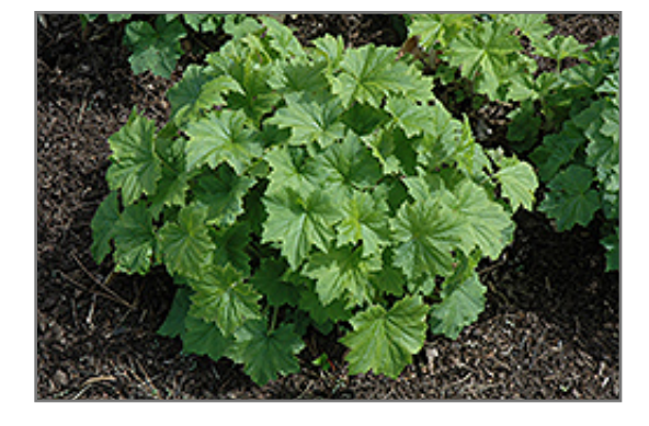
Autumn Bride Hairy Alumroot

Autumn Bride Hairy Alumroot is recommended for the following landscape applications;