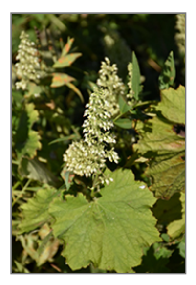
Autumn Bride Hairy Alumroot flowers