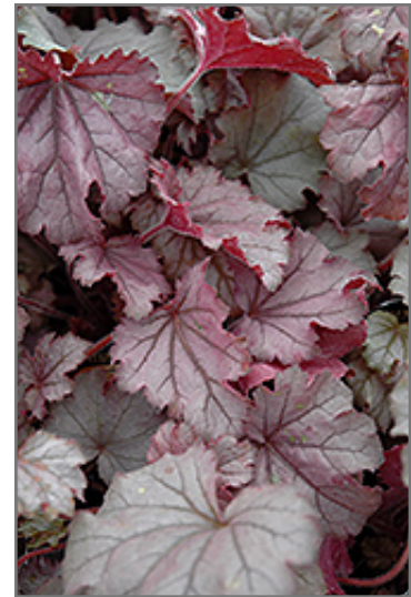
Little Cuties Sugar Berry Coral Bells foliage

Little Cuties Sugar Berry Coral Bells is recommended for the following landscape applications;