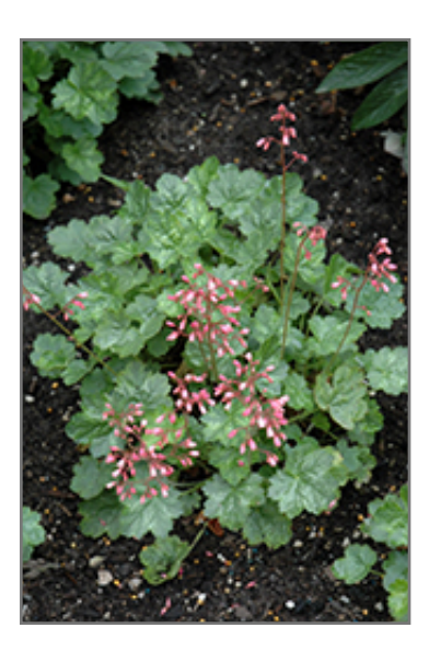
Little Cuties Peppermint Coral Bells in bloom