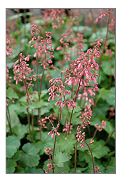
Little Cuties Peppermint Coral Bells flowers

Little Cuties Peppermint Coral Bells is recommended for the following landscape applications;