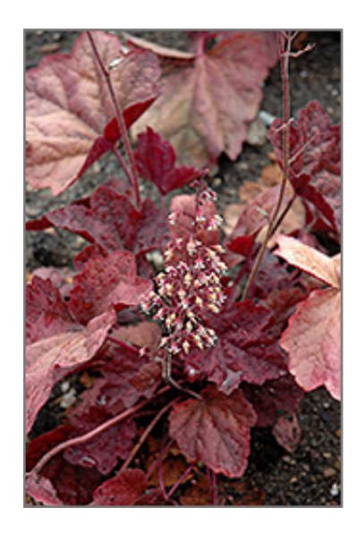
Lava Lamp Coral Bells flowers