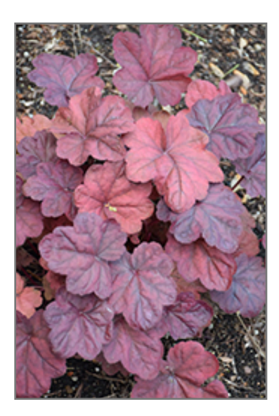
Lava Lamp Coral Bells foliage

This is a relatively low maintenance plant, and should be cut back in late fall in preparation for winter. It is a good choice for attracting hummingbirds to your yard. It has no significant negative characteristics.