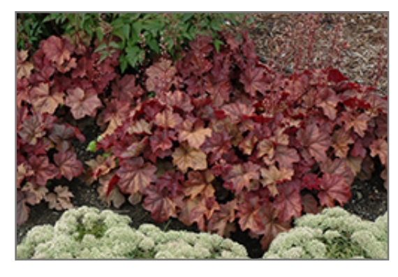
Lava Lamp Coral Bells

Lava Lamp Coral Bells will grow to be about 16 inches tall at maturity extending to 32 inches tall with the flowers, with a spread of 28 inches. When grown in masses or used as a bedding plant, individual plants should be spaced approximately 24 inches apart. Its foliage tends to remain dense right to the ground, not requiring facer plants in front. It grows at a medium rate, and under ideal conditions can be expected to live for approximately 10 years. As an evegreen perennial, this plant will typically keep its form and foliage year-round.