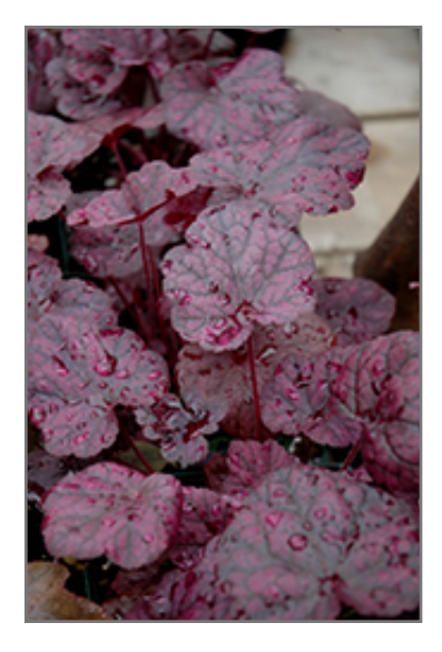
Grape Expectations Coral Bells foliage

Grape Expectations Coral Bells is recommended for the following landscape applications;