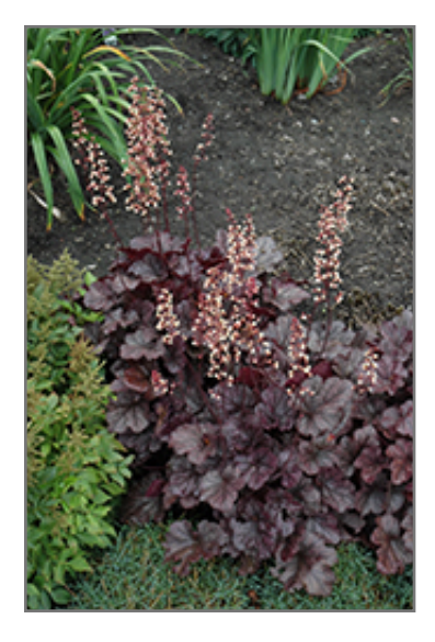
Grape Expectations Coral Bells in bloom