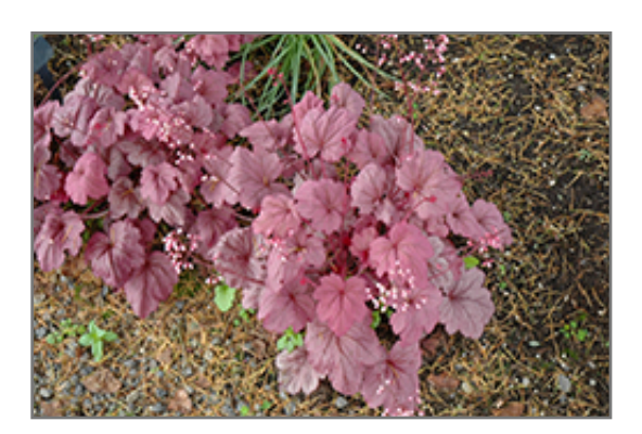
Georgia Plum Coral Bells

Georgia Plum Coral Bells is recommended for the following landscape applications;