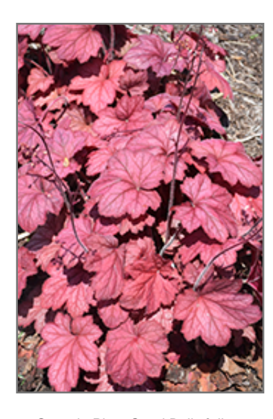
Georgia Plum Coral Bells foliage

This is a relatively low maintenance plant, and should be cut back in late fall in preparation for winter. It is a good choice for attracting hummingbirds to your yard. It has no significant negative characteristics.