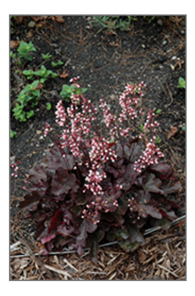
Dolce Brazen Raisin Coral Bells in bloom