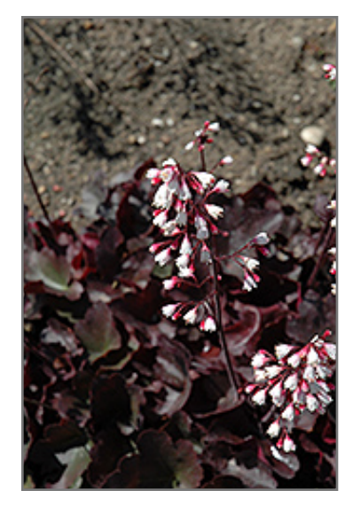
Dolce Brazen Raisin Coral Bells flowers

Dolce Brazen Raisin Coral Bells is a dense herbaceous evergreen perennial with tall flower stalks held atop a low mound of foliage. Its relatively fine texture sets it apart from other garden plants with less refined foliage.