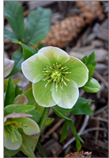
Snow Bunting Hellebore flowers