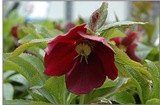
Red Racer Hellebore flowers

Red Racer Hellebore is recommended for the following landscape applications;