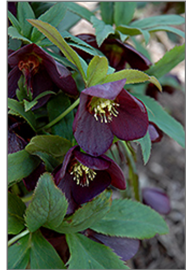
Night Coaster Hellebore flowers