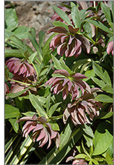
Kingston Cardinal Hellebore flowers