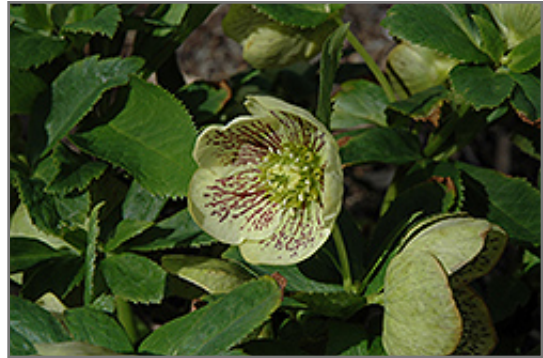
Ice Follies Hellebore flowers