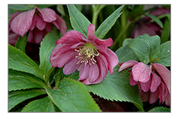
Heronswood Double Purple Hellebore flowers