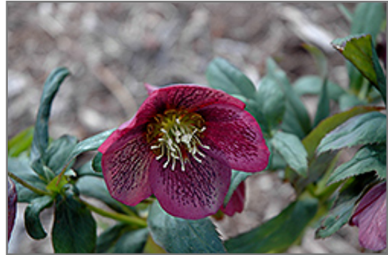
Grape Galaxy Hellebore flowers