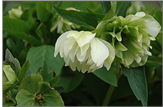
Double Integrity Hellebore flowers