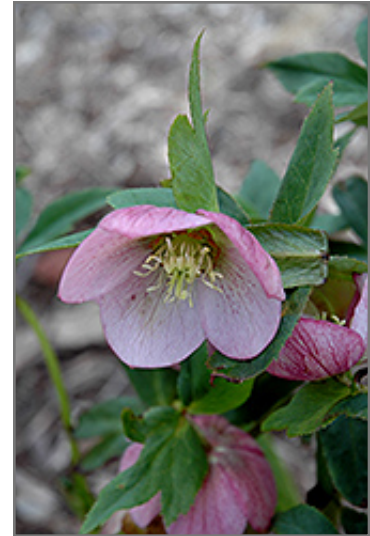
Angel Glow Hellebore flowers