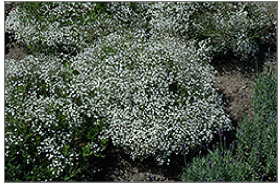
Summer Sparkles Baby's Breath in bloom

This plant should only be grown in full sunlight. It prefers dry to average moisture levels with very well-drained soil, and will often die in standing water. It is considered to be drought-tolerant, and thus makes an ideal choice for a low-water garden or xeriscape application. It is not particular as to soil type, but has a definite preference for alkaline soils, and is able to handle environmental salt. It is highly tolerant of urban pollution and will even thrive in inner city environments. This is a selected variety of a species not originally from North America.