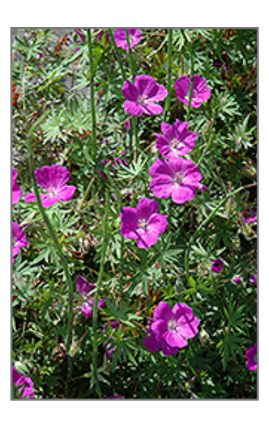
Elsbeth Cranesbill flowers

Perfect as a groundcover, this low mounded variety has small, deeply lobed leaves that turn crimson red in the fall; bathed in beautiful magenta saucer-shaped blooms throughout summer; deadhead spent flowers for reblooming later in the season