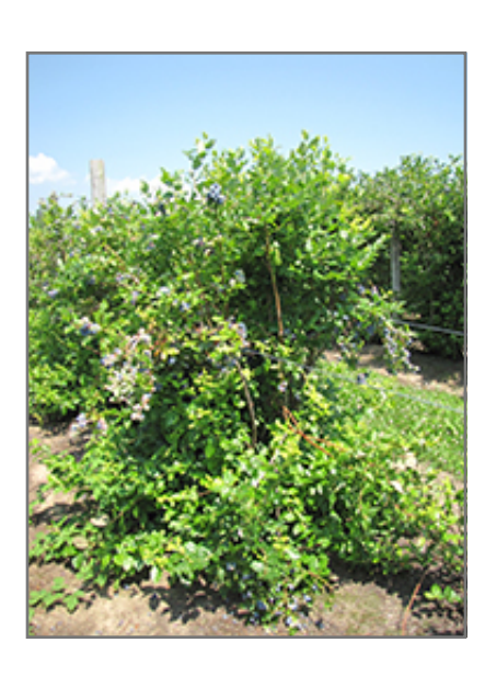
Duke Blueberry fruit