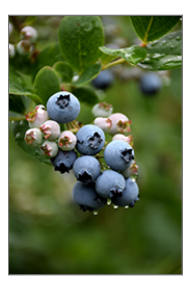
Duke Blueberry fruit