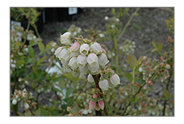
Duke Blueberry flowers