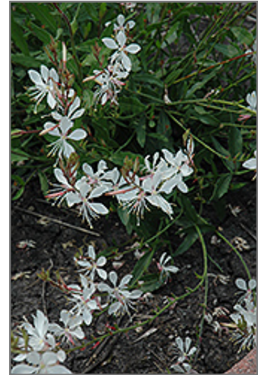
Sparkle White Gaura flowers

This is a relatively low maintenance plant, and is best cleaned up in early spring before it resumes active growth for the season. It is a good choice for attracting butterflies to your yard, but is not particularly attractive to deer who tend to leave it alone in favor of tastier treats. It has no significant negative characteristics.