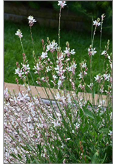
Sparkle White Gaura in bloom

Sparkle White Gaura is a fine choice for the garden, but it is also a good selection for planting in outdoor pots and containers. With its upright habit of growth, it is best suited for use as a 'thriller' in the 'spiller-thriller-filler' container combination; plant it near the center of the pot, surrounded by smaller plants and those that spill over the edges. It is even sizeable enough that it can be grown alone in a suitable container. Note that when growing plants in outdoor containers and baskets, they may require more frequent waterings than they would in the yard or garden. Be aware that in our climate, most plants cannot be expected to survive the winter if left in containers outdoors, and this plant is no exception. Contact our experts for more information on how to protect it over the winter months.