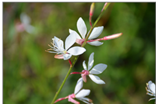
Sparkle White Gaura flowers