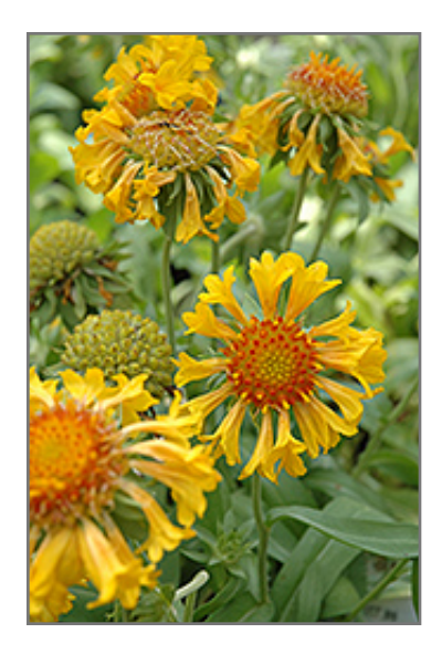
Commotion Moxie Blanket Flower flowers

Stunning bright yellow flowers with orange centers contrast beautifully with its green leaves; a profuse bloomer that will bloom all summer with deadheading; attracts butterflies, great for cutting, heat tolerant and deer resistant