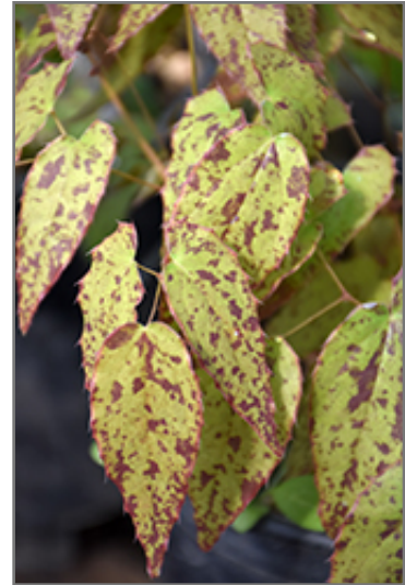
Pink Champagne Fairy Wings foliage

Pink Champagne Fairy Wings is a fine choice for the garden, but it is also a good selection for planting in outdoor pots and containers. Because of its spreading habit of growth, it is ideally suited for use as a 'spiller' in the 'spiller-thriller-filler' container combination; plant it near the edges where it can spill gracefully over the pot. Note that when growing plants in outdoor containers and baskets, they may require more frequent waterings than they would in the yard or garden. Be aware that in our climate, most plants cannot be expected to survive the winter if left in containers outdoors, and this plant is no exception. Contact our experts for more information on how to protect it over the winter months.