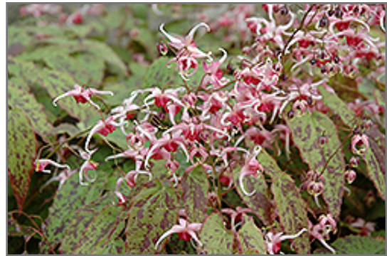
Pink Champagne Fairy Wings flowers

This plant will require occasional maintenance and upkeep, and is best cleaned up in early spring before it resumes active growth for the season. It is a good choice for attracting bees to your yard, but is not particularly attractive to deer who tend to leave it alone in favor of tastier treats. Gardeners should be aware of the following characteristic(s) that may warrant special consideration;