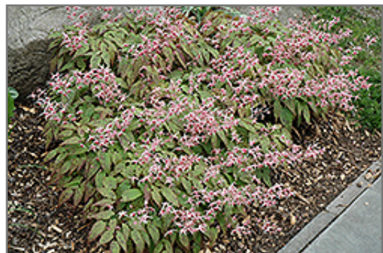
Pink Champagne Fairy Wings in bloom