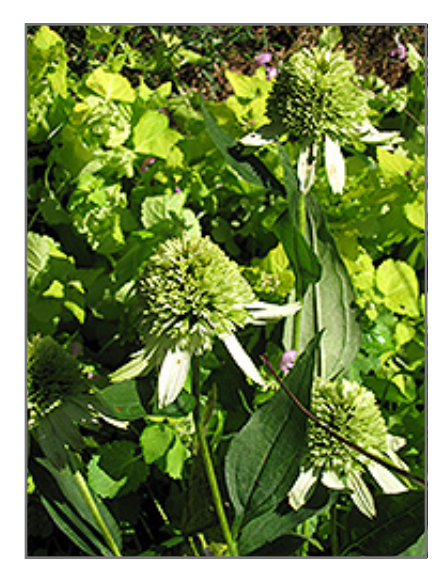
Greenline Coneflower flowers

Greenline Coneflower is recommended for the following landscape applications;