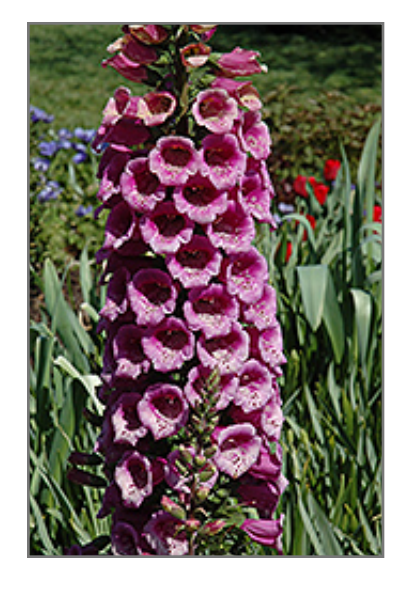
Excelsior Purple Foxglove flowers