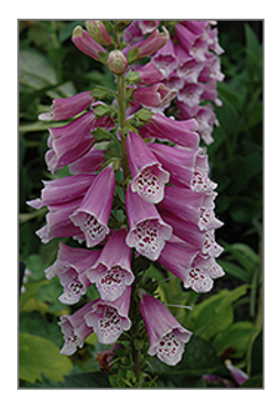
Dalmatian Rose Foxglove flowers