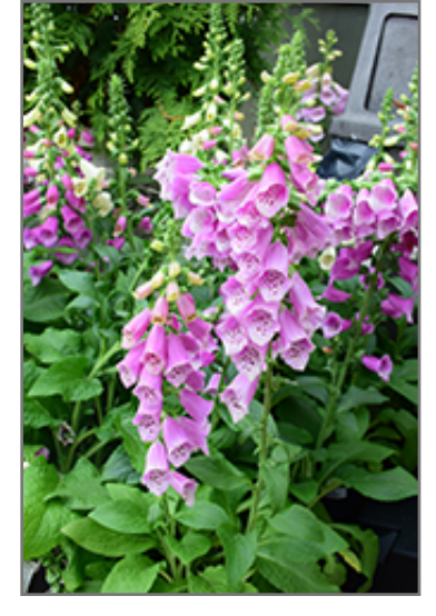
Dalmatian Rose Foxglove flowers

This plant will require occasional maintenance and upkeep, and is best cleaned up in early spring before it resumes active growth for the season. It is a good choice for attracting hummingbirds to your yard, but is not particularly attractive to deer who tend to leave it alone in favor of tastier treats. Gardeners should be aware of the following characteristic(s) that may warrant special consideration;