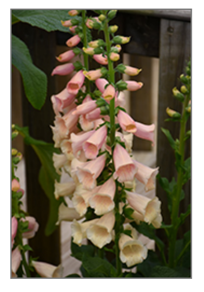
Dalmatian Peach Foxglove flowers

Lovely peach tubular flowers with pale orange interiors and darker orange spots; tall spikes rise above attractive green lance-shaped leaves; a biennial that's happiest in part shade with adequate moisture