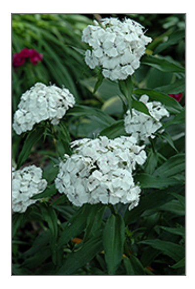
White Sweet William flowers

Deliciously clove-scented, velvety frilly white flower clusters; optimal site has full sun with ample moisture; amend clay soils for best growth; seeds freely but divide for truest color