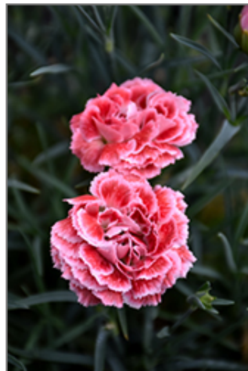
Coral Reef Pinks flowers

This is a relatively low maintenance plant, and is best cleaned up in early spring before it resumes active growth for the season. It is a good choice for attracting bees and butterflies to your yard, but is not particularly attractive to deer who tend to leave it alone in favor of tastier treats. It has no significant negative characteristics.