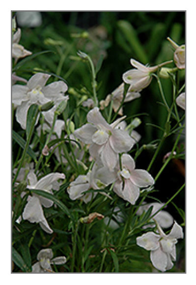
Butterfly Rose Delphinium flowers

Magnificent variety displays airy rose-pink flowers on a mounded plant; a perfect selection for smaller places in the garden, put in containers and along borders