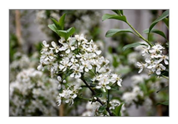
Carmine Jewel Cherry flowers