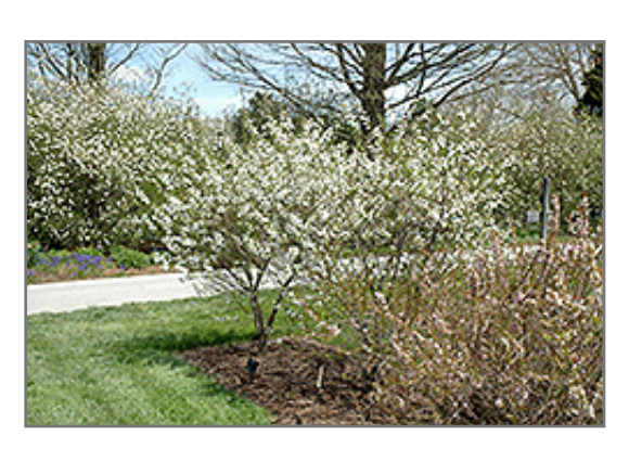
Carmine Jewel Cherry in bloom