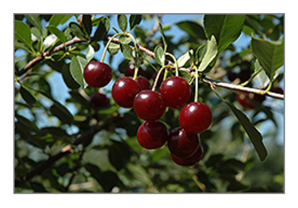
Carmine Jewel Cherry fruit

Carmine Jewel Cherry is draped in stunning clusters of fragrant white flowers along the branches in mid spring before the leaves. It has dark green deciduous foliage. The pointy leaves turn an outstanding yellow in the fall. The fruits are showy crimson drupes with hints of deep purple, which are carried in abundance in mid summer. The fruit can be messy if allowed to drop on the lawn or walkways, and may require occasional clean-up.