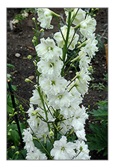
New Millennium Stars Larkspur flowers

A magnificent color mix of all the New Millennium hybrid varieties, white, to pink, to purple; good vertical form, dense flower spikes and strong stems; excellent uniformity