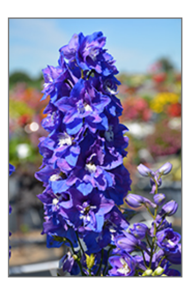
Dasante Blue Larkspur flowers

This exciting compact variety shows off vibrant blue flowers with lavender accents and contrasting white bees; uniform growth habit looks very impressive when massed