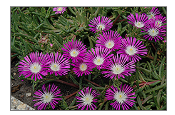
Stardust Ice Plant flowers

Stardust Ice Plant is recommended for the following landscape applications;