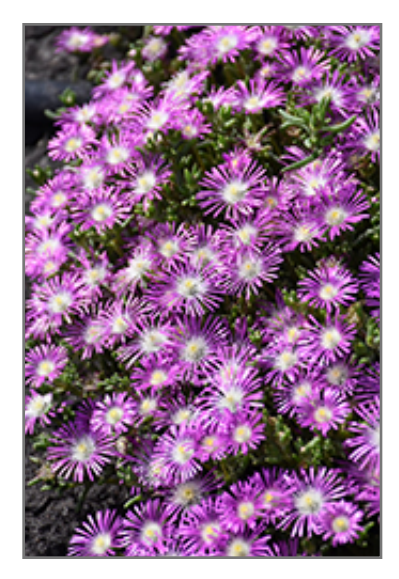
Stardust Ice Plant flowers

This is a relatively low maintenance plant, and is best cleaned up in early spring before it resumes active growth for the season. It is a good choice for attracting bees and butterflies to your yard. It has no significant negative characteristics.