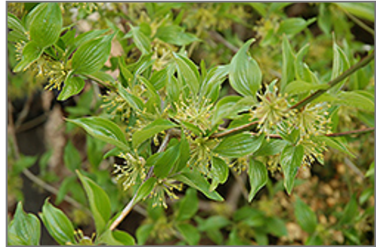
Lemon Zest Japanese Cornelian Dogwood flowers

Lemon Zest Japanese Cornelian Dogwood is recommended for the following landscape applications;