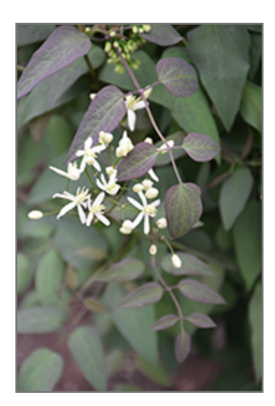
Serious Black Ground Clematis flowers

This plant does best in full sun to partial shade. It is very adaptable to both dry and moist growing conditions, but will not tolerate any standing water. It is not particular as to soil type or pH. It is highly tolerant of urban pollution and will even thrive in inner city environments. This is a selected variety of a species not originally from North America.