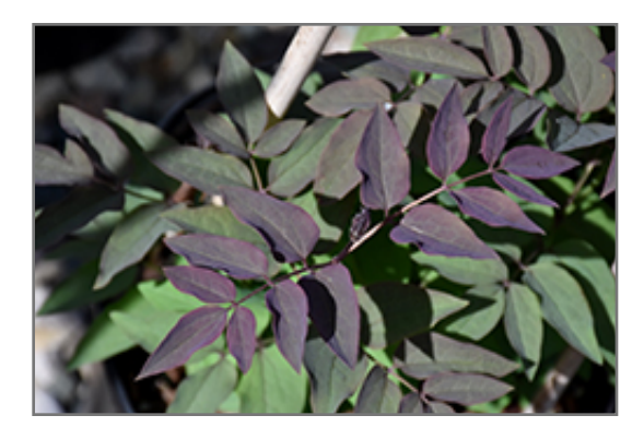
Serious Black Ground Clematis foliage

Serious Black Ground Clematis is recommended for the following landscape applications;