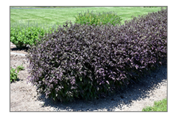
Serious Black Ground Clematis