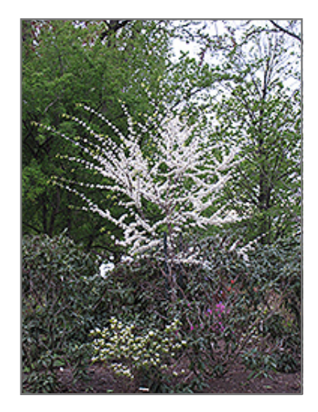
Texas White Redbud in bloom