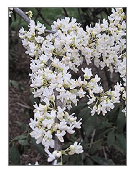
Texas White Redbud flowers

Texas White Redbud is recommended for the following landscape applications;