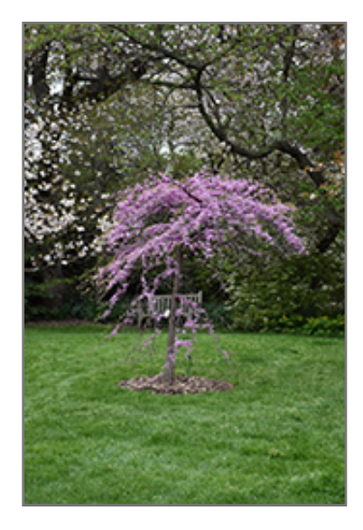
Cascading Hearts Redbud in bloom

Cascading Hearts Redbud is recommended for the following landscape applications;