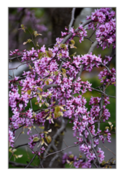
Cascading Hearts Redbud flowers