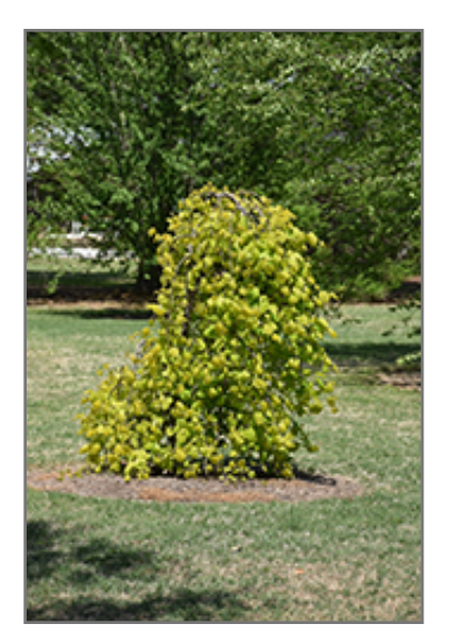
Cascading Hearts Redbud

This shrub does best in full sun to partial shade. It prefers to grow in average to moist conditions, and shouldn't be allowed to dry out. It is not particular as to soil type or pH. It is highly tolerant of urban pollution and will even thrive in inner city environments, and will benefit from being planted in a relatively sheltered location. Consider applying a thick mulch around the root zone in winter to protect it in exposed locations or colder microclimates. This is a selection of a native North American species.