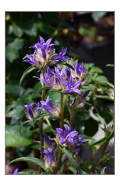
Genti Twisterbell Clustered Bellflower flowers