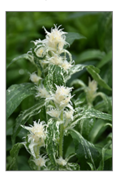
Genti Twisterbell Clustered Bellflower flower buds