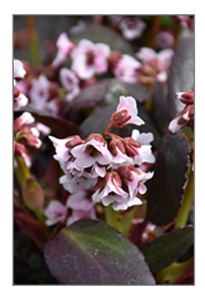
Dragonfly Angel Kiss Bergenia flowers

Large glossy, leathery, cabbage-like leaves turn burgundy-black late in the season; interesting clusters of white, to pale pink flowers rise above foliage on red stems; great for shady areas; water regularly but don't overwater