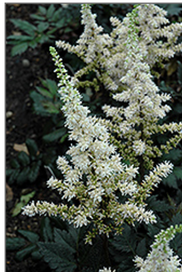
Visions in White Chinese Astilbe flowers