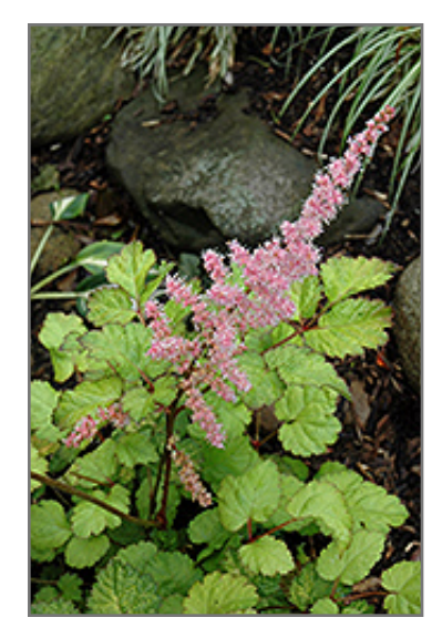
Amber Moon Chinese Astilbe flowers