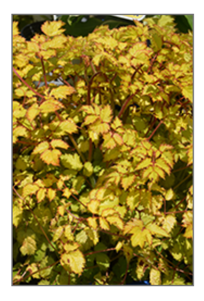
Amber Moon Chinese Astilbe foliage

Amber Moon Chinese Astilbe is recommended for the following landscape applications;