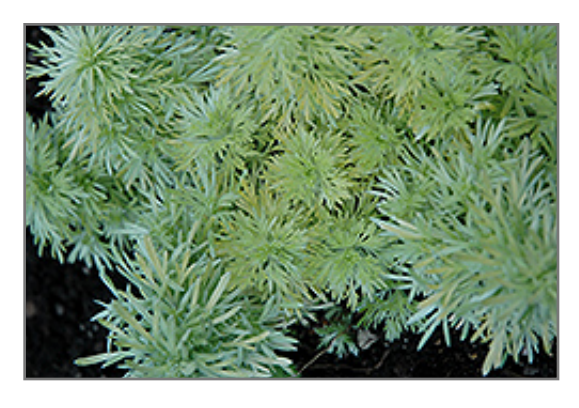
Ever Goldy Artemisia foliage