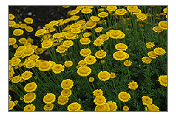
Charme Marguerite Daisy flowers

Charme Marguerite Daisy is an herbaceous perennial with a mounded form. It brings an extremely fine and delicate texture to the garden composition and should be used to full effect.