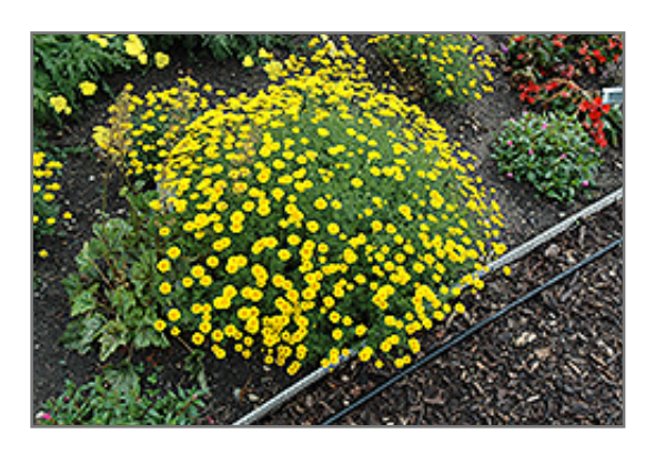
Charme Marguerite Daisy in bloom

This is a high maintenance plant that will require regular care and upkeep, and is best cleaned up in early spring before it resumes active growth for the season. Deer don't particularly care for this plant and will usually leave it alone in favor of tastier treats. Gardeners should be aware of the following characteristic(s) that may warrant special consideration;