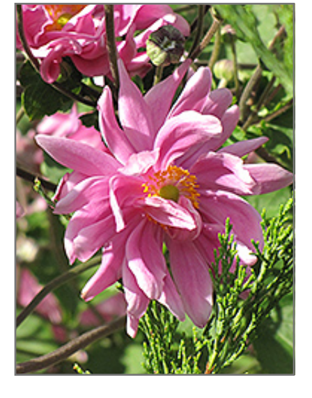
Bressingham Glow Anemone flowers

An outstanding selection for the late summer garden; branching stems of deep rose pink flowers are great for cutting;; good for a partial shade area; mulch in colder winter areas; may need support; beautiful when massed or in containers