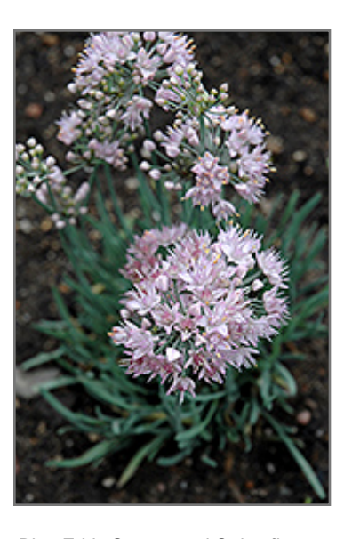
Blue Eddy Ornamental Onion flowers

Blue Eddy Ornamental Onion is recommended for the following landscape applications;