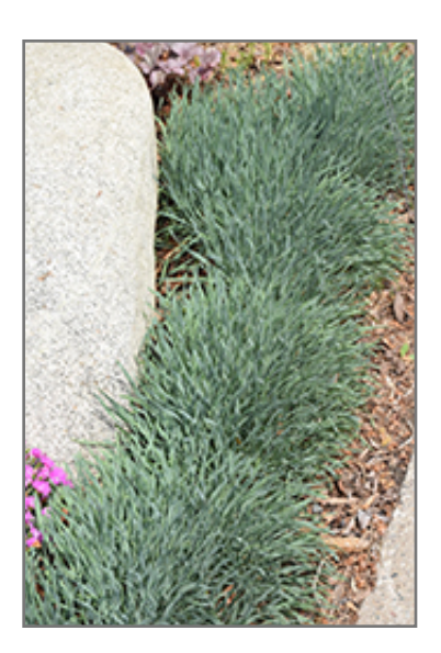
Blue Eddy Ornamental Onion