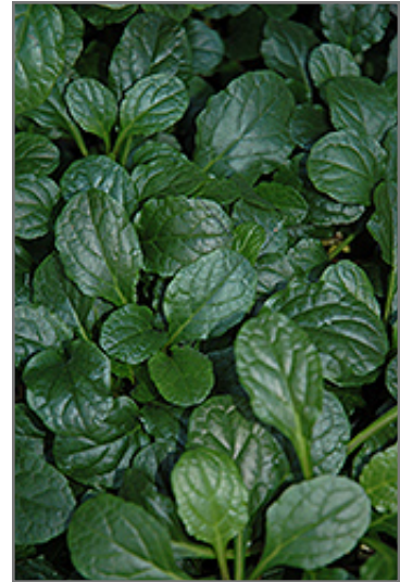
Hill Country Bugleweed foliage