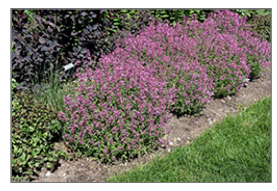
Rosie Posie Hyssop in bloom

Rosie Posie Hyssop will grow to be about 18 inches tall at maturity, with a spread of 32 inches. It grows at a fast rate, and under ideal conditions can be expected to live for approximately 6 years. As an herbaceous perennial, this plant will usually die back to the crown each winter, and will regrow from the base each spring. Be careful not to disturb the crown in late winter when it may not be readily seen!