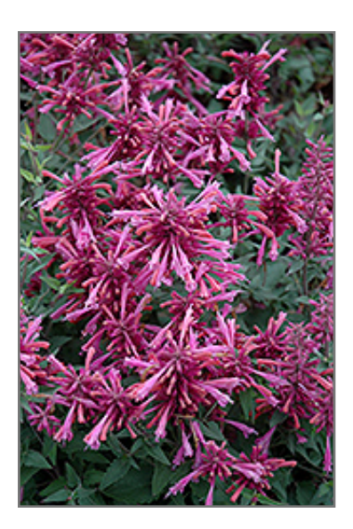
Rosie Posie Hyssop flowers

This is a relatively low maintenance plant, and is best cleaned up in early spring before it resumes active growth for the season. It is a good choice for attracting bees, butterflies and hummingbirds to your yard, but is not particularly attractive to deer who tend to leave it alone in favor of tastier treats. It has no significant negative characteristics.