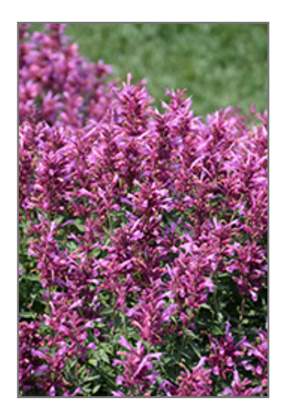
Rosie Posie Hyssop flowers