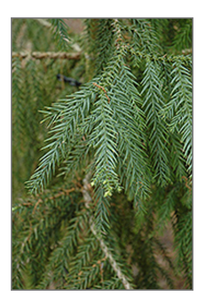
Taiwania foliage