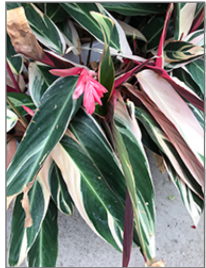
Tricolor Stromanthe flowers

This plant does best in full sun to partial shade. It prefers to grow in average to moist conditions, and shouldn't be allowed to dry out. It is not particular as to soil pH, but grows best in rich soils. It is somewhat tolerant of urban pollution. This is a selected variety of a species not originally from North America. It can be propagated by division; however, as a cultivated variety, be aware that it may be subject to certain restrictions or prohibitions on propagation.